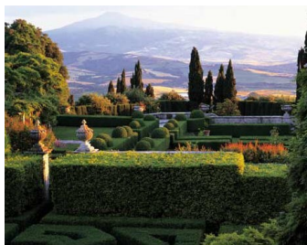
La Foce Gardens