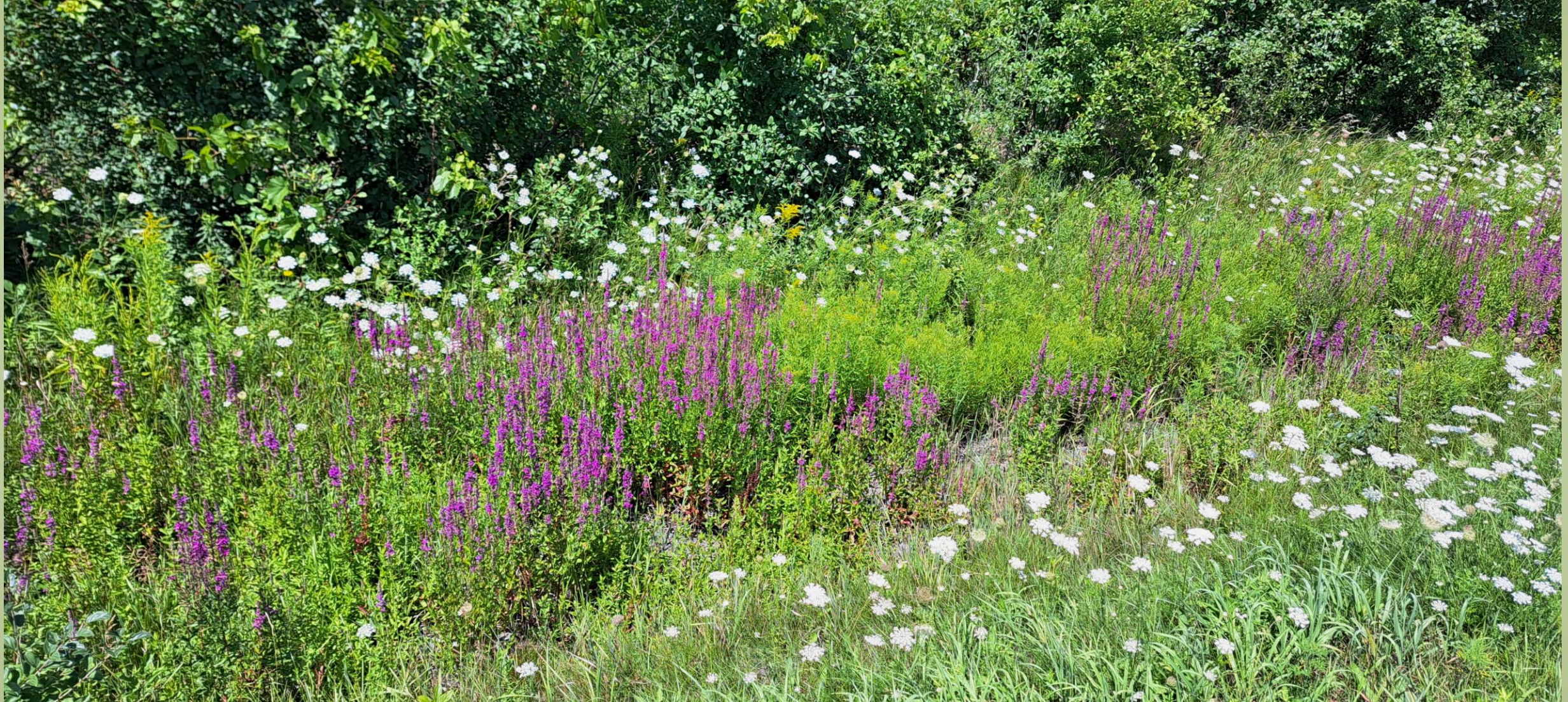
THIRD PLACE – BEATE HERZIG