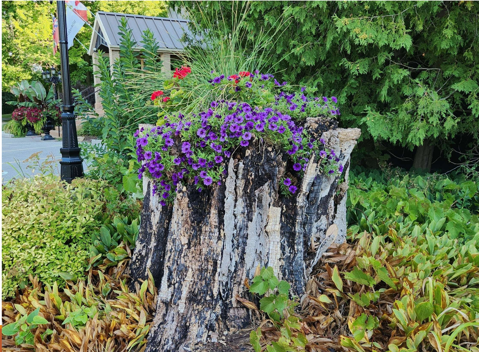
3 rd , Class 3 Shelley Sissing