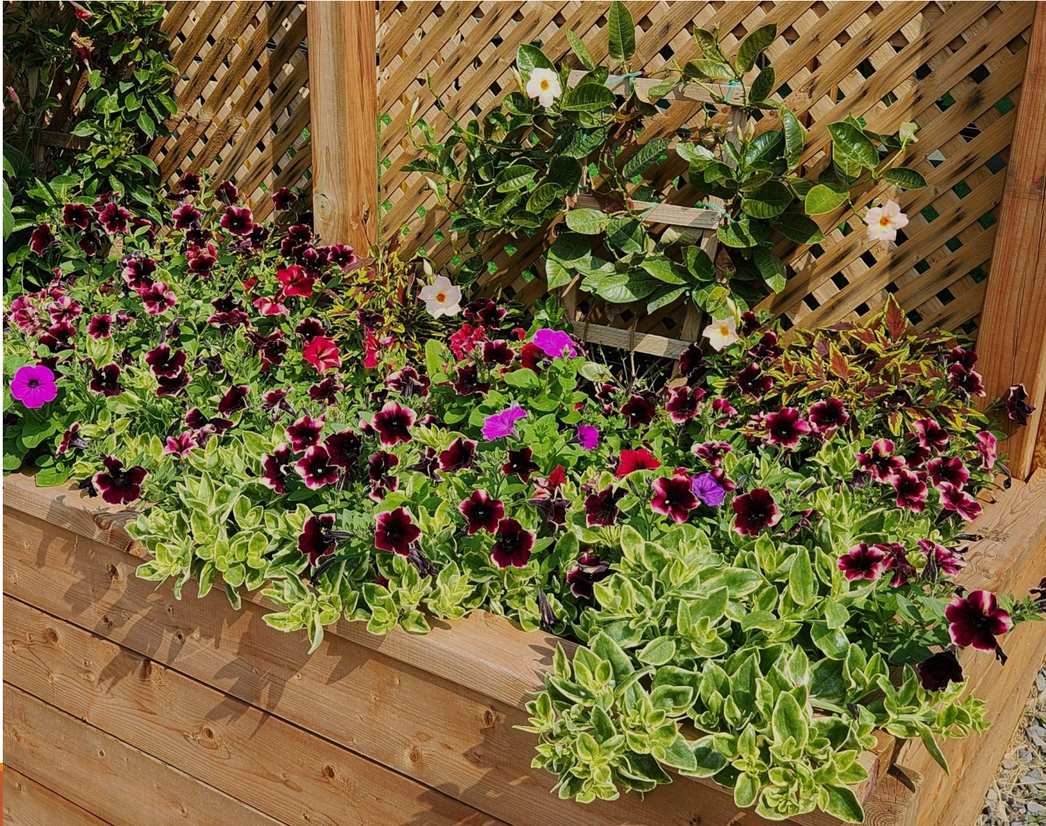
2 nd , Class 3 Shelley Sissing