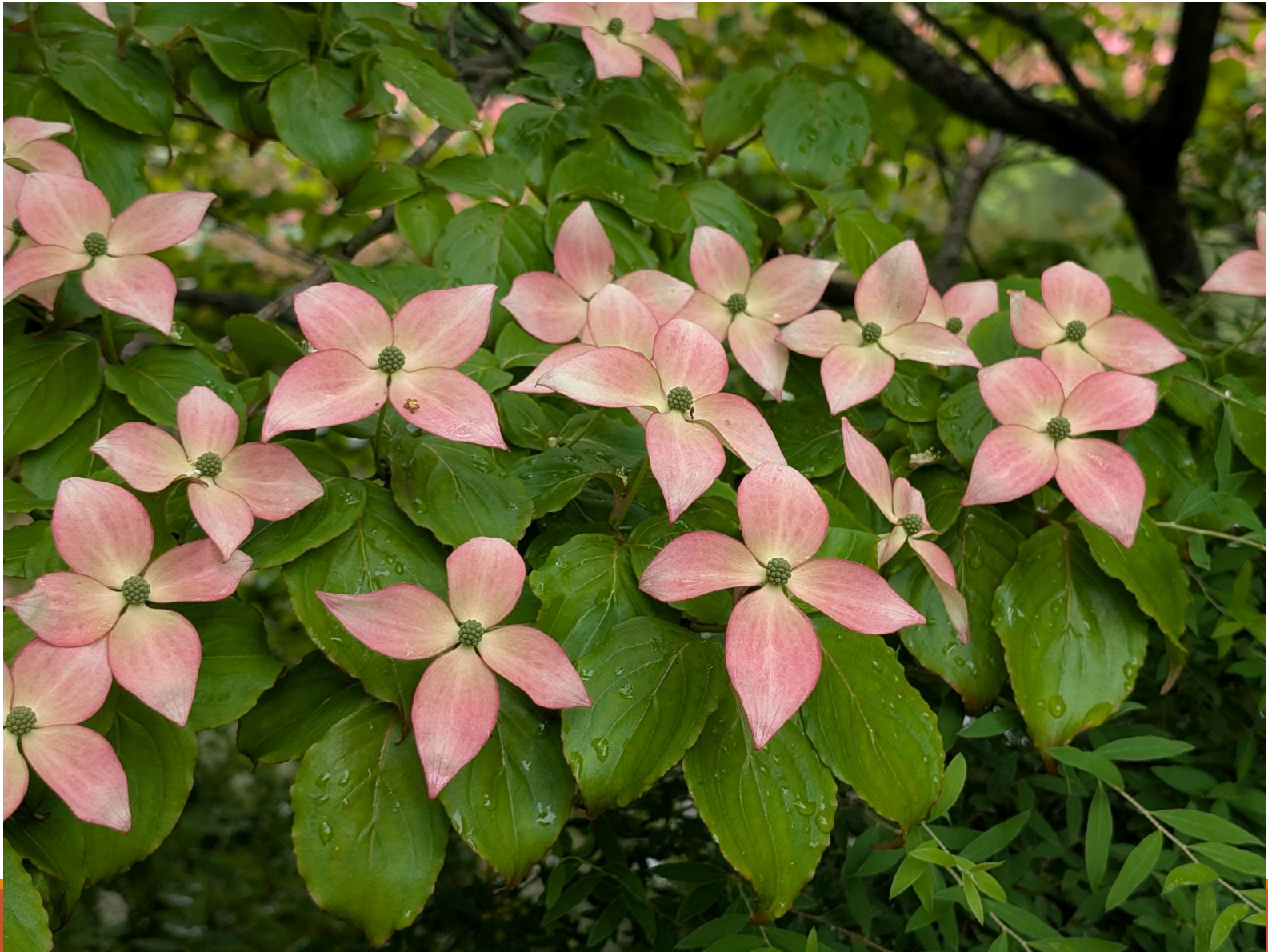
2 nd , Class 6 Maureen Llanos