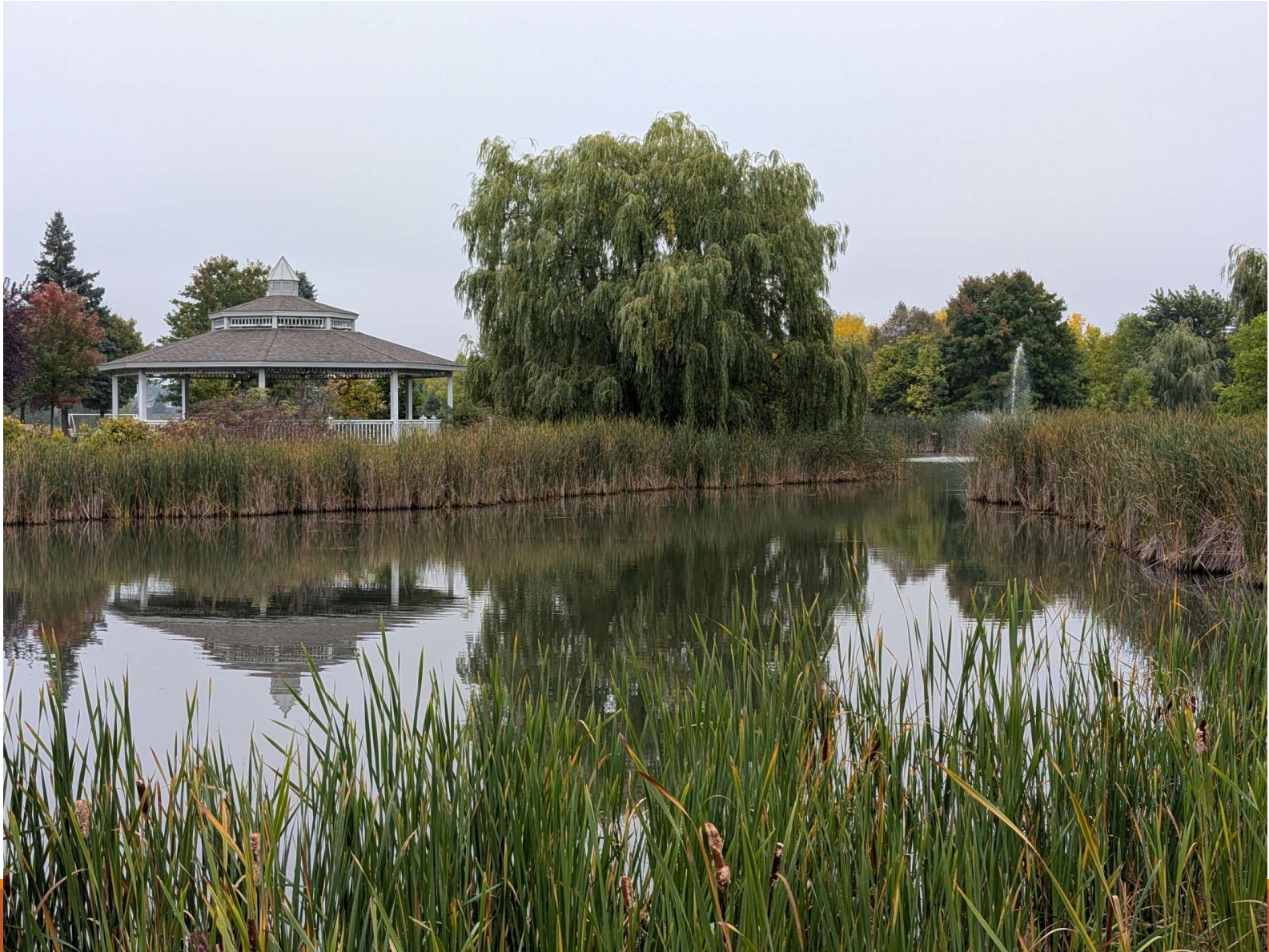
3 rd , Class 4 Maureen Llanos