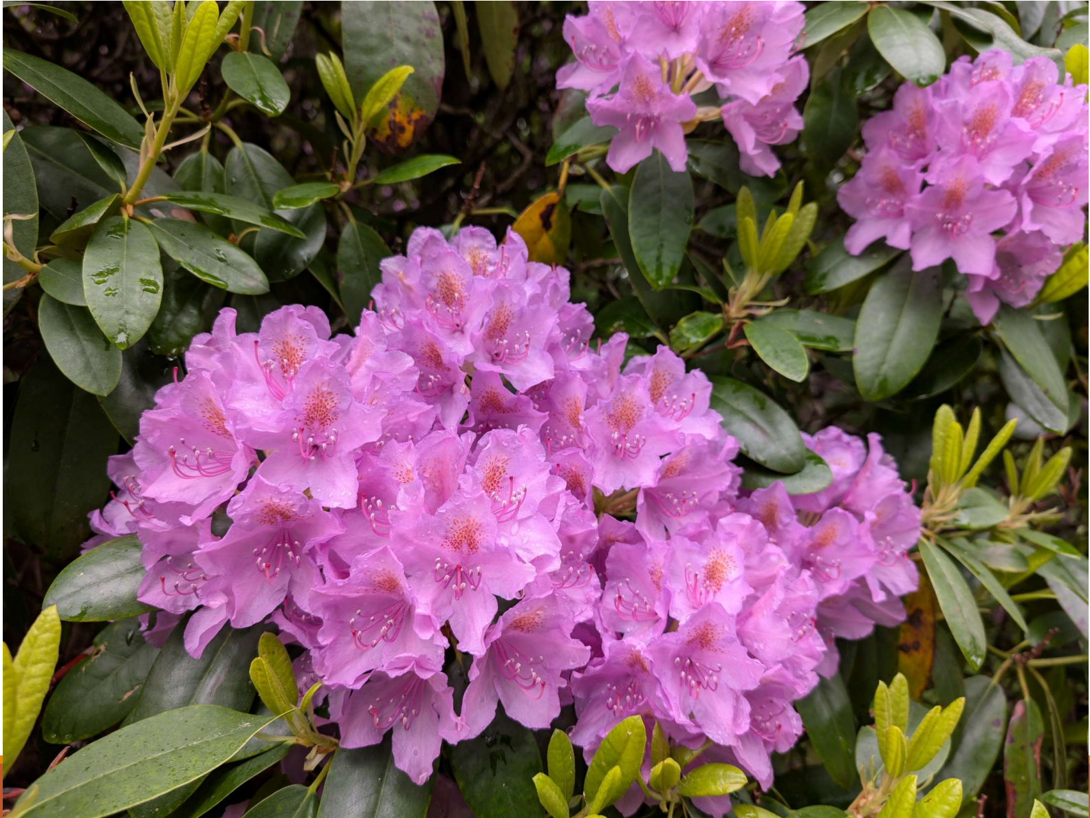
2 nd Class 1, Edwin Llanos