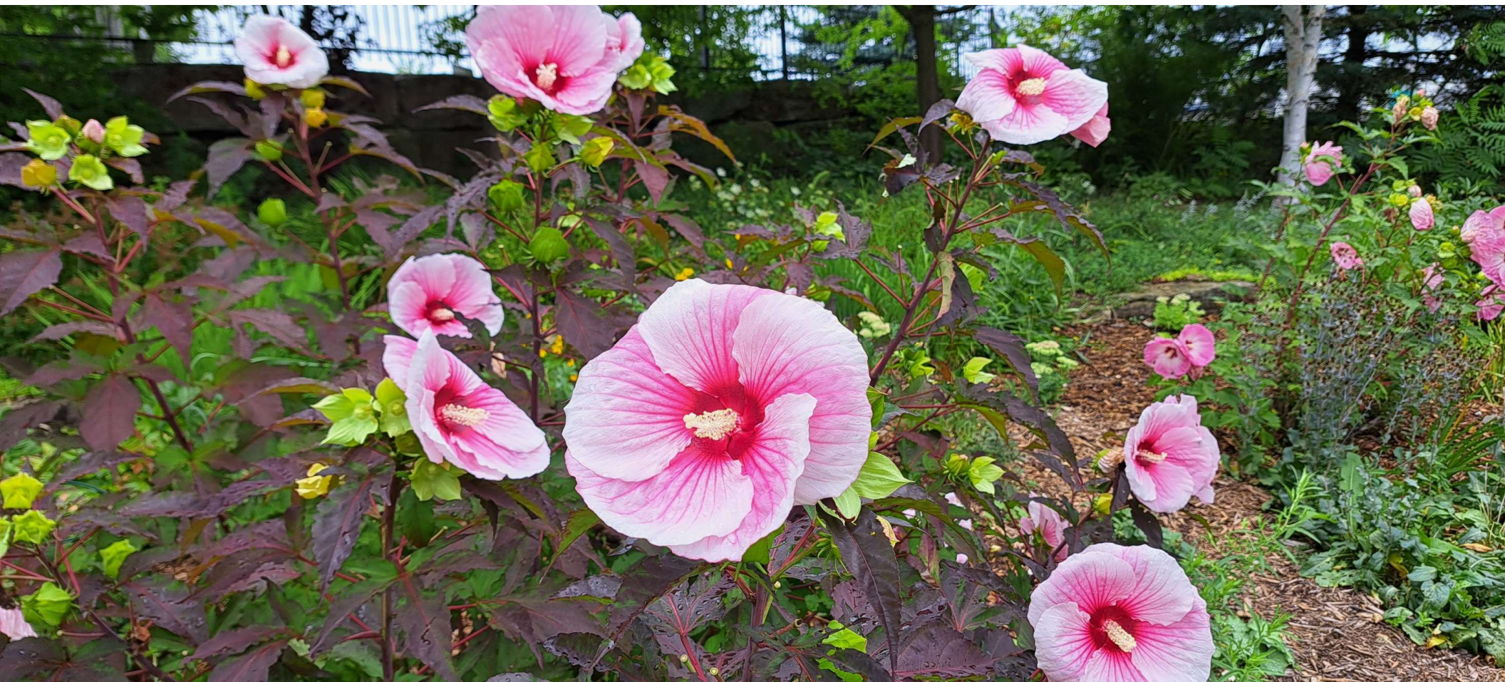
1 st , Class 5 Beate Herzig