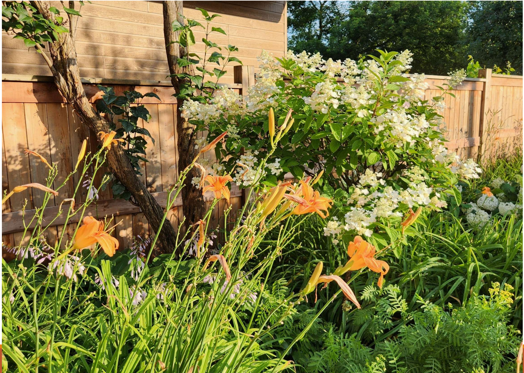
3 rd , Class 5 Shelley Sissing