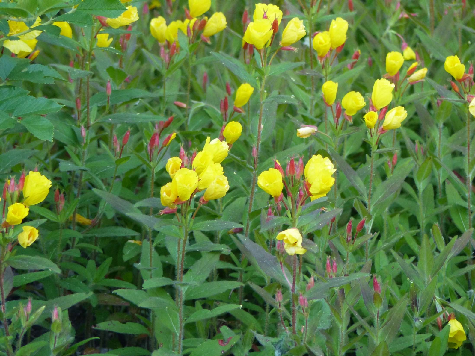
2 nd , Class 5 Beate Herzig