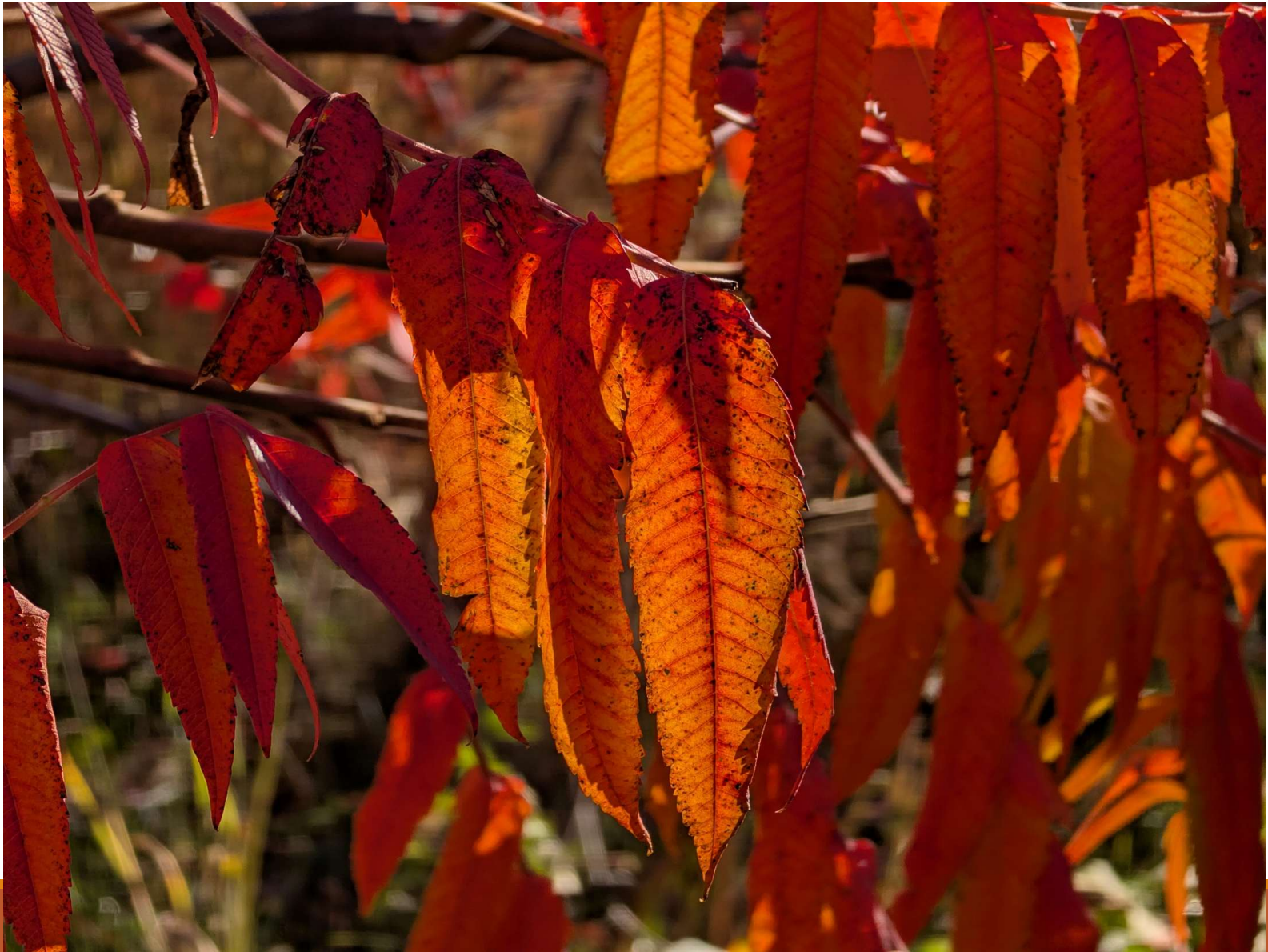
3 rd , Class 2 Edwin Llanos