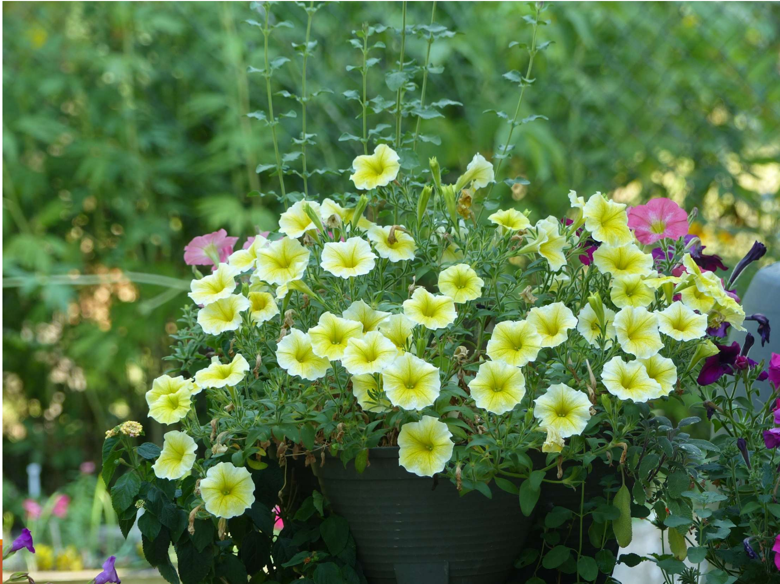
1 st , Class 3 Beate Herzig