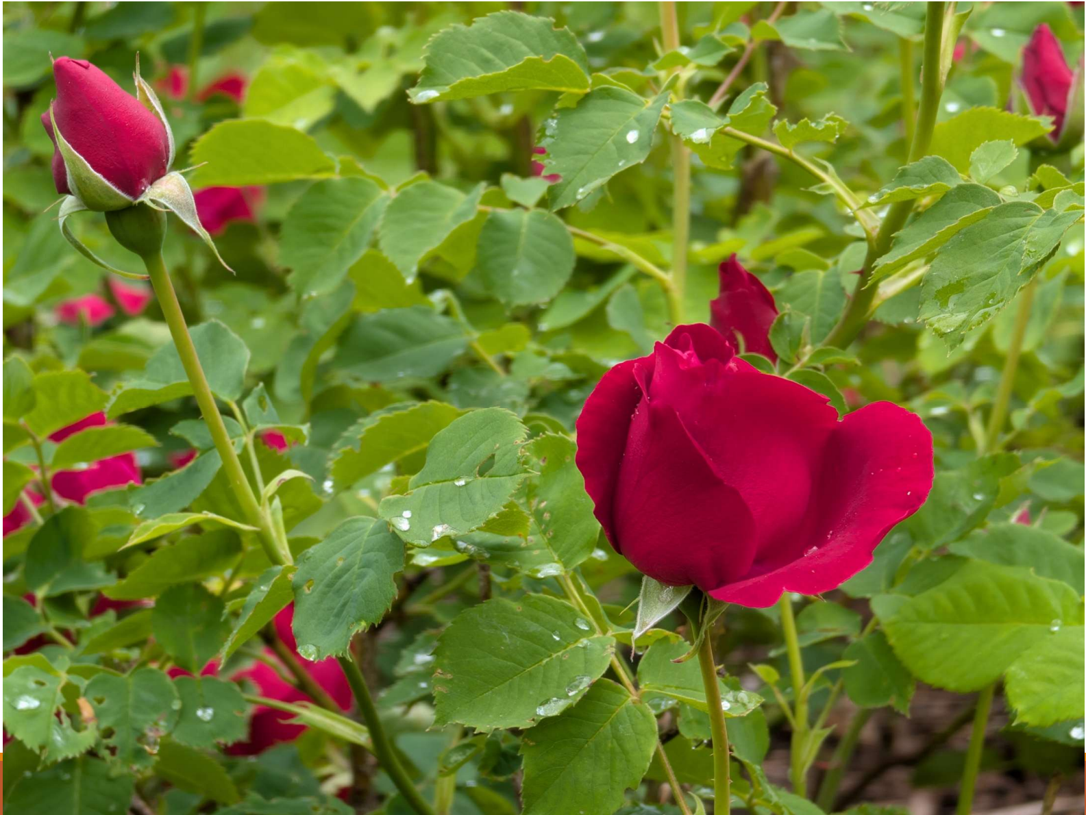
3 rd , Class 1 Edwin Llanos